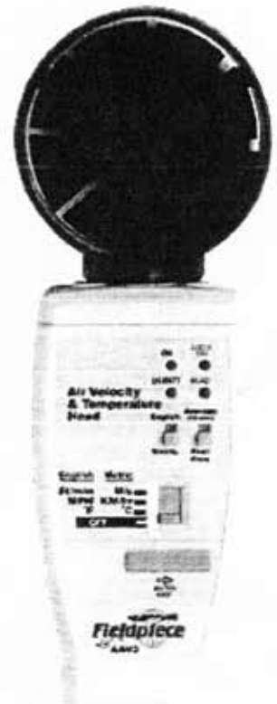
Fieldpiece Air Velocity Head